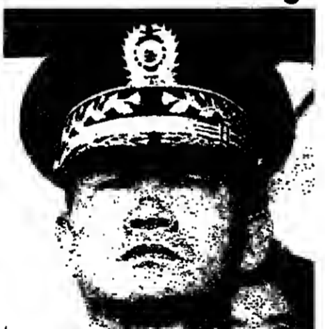
S. Korean President Chun Doo-hwan

SEOUL, March 26 (Agencies) — The government party led by President Chun Doo-hwan gained its expected, solid control of South Korea's new National Assembly, official election returns showed Thursday. Election committee officials announced that the Democratic Justice Party won 90 assembly seats in the popular voting Wednesday. As the first place party, the government's political organization gained 61 additional seats under a proportional representation system for a total of 151 in the 276-member assembly.